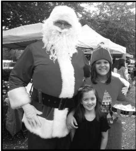
Children and adults will find something fun to do at Music Showcase's Annual Christmas Festival.