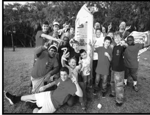
Faces of Courage will be hosting its 2013 Santa's Workshop Weekend on December 6-8 at Rotary's Camp Florida. The camp is in its twelfth year and its campers are children who have cancer or a blood disorder or are survivors of cancer or a blood disorder.

Faces of Courage will be hosting its 2013 Santa's Workshop Weekend on Friday-Sunday, December 6-8 at Rotary's Camp Florida. The camp is in its twelfth year and its campers are children who have cancer or a blood disorder or are survivors of cancer or a blood disorder. The free weekend-long, medically supervised camp also includes the camper's siblings. "Every year we up the stakes for kid's camp," said Peggie Sherry, founder of Faces of Courage. "We will have more celebrities, gifts, games and activities for Santa's Workshop this year."